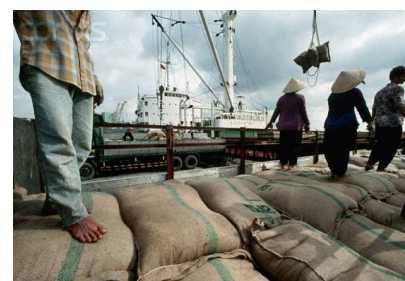
Rice bags to be loaded onto ship