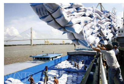
Loading rice for export at Saigon Port