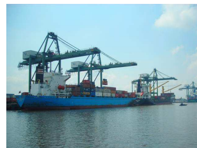
Saigon Port

Vietnam's impressive and consistent growth in recent years (in Asia, second only to China) has made Vietnam more and more visible on the global economic map, especially for those multinational corporations seeking to outsource or relocate.